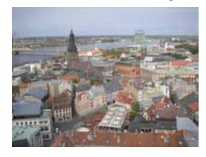
The winding cobblestone streets in the old quarter are bor-